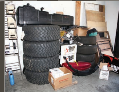
The 40-inch Toyos waiting for install at ATF Motorsports.