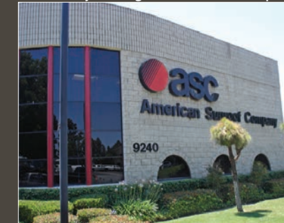
American Sunroof Company added a sunroof where there was none before. Looks like a factory job now.