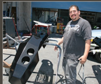
Luis Garcia of Trigger Nasty painted the Road Armor bumpers to complement the truck.