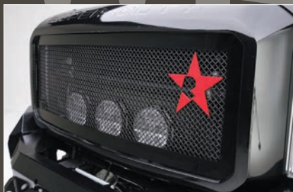
RBP supplied the grille.