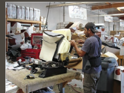
Top Stitch Upholstery did a bang-up job on the interior of the Ford.

their products, too. And she called 8-Lug to inquire about a feature article. Word spread, and soon Mike actually had to make choices about which products to go with.