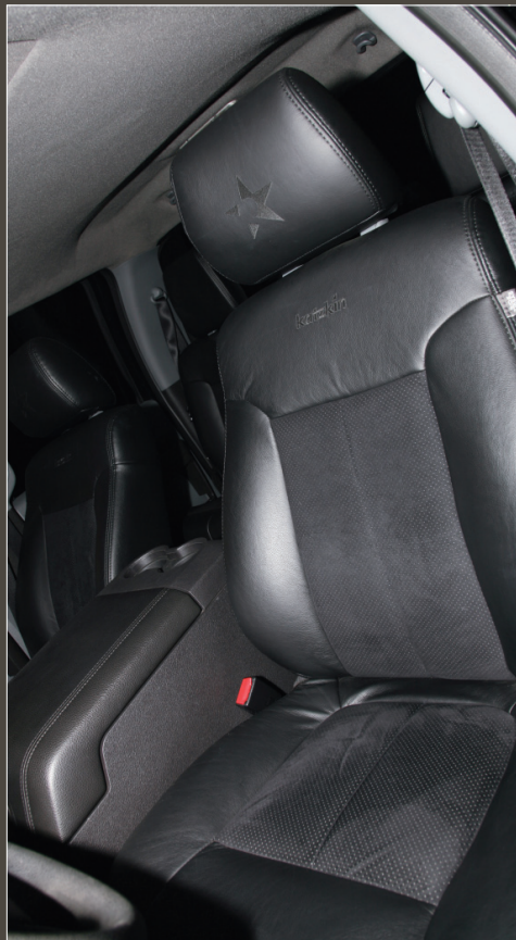
Top Stitch Upholstery did a masterful job with the interior. Katzkin covered the seats.