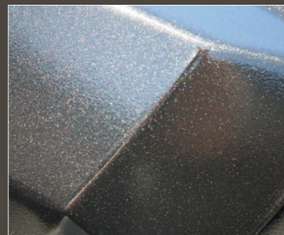
Look at the colored metal flakes in that bumper...wow!