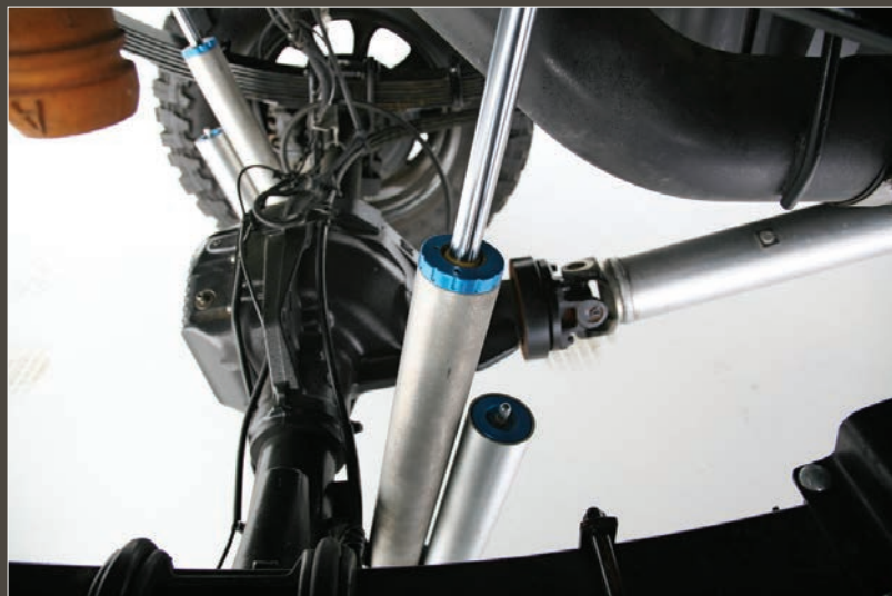
King remote-reservoir shocks make the ride smooth.