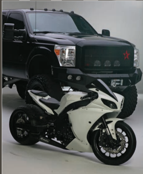
The '09 Yamaha R1 has a long list of products added to it, including Triggery Nasty Paint, Top Stitch Upholstery, Nitrous Express, Avon Tyres, and more.