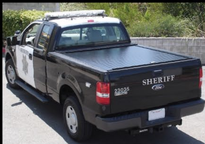
San Diego Sheriff's Dept. F-150

Keep the cover clean and it will last - it's as simple as that!