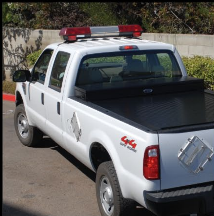
U.S. Marine Corp F-250 Toolbox Cover