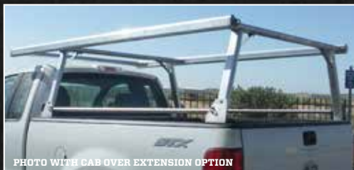
PHOTO WITH CAB OVER EXTENSION OPTION